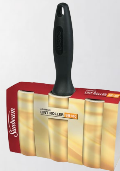
LINT ROLLER + REFILLS SB180