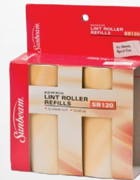
LINT ROLLER REFILLS SB120