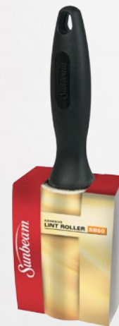
LINT ROLLER SB60